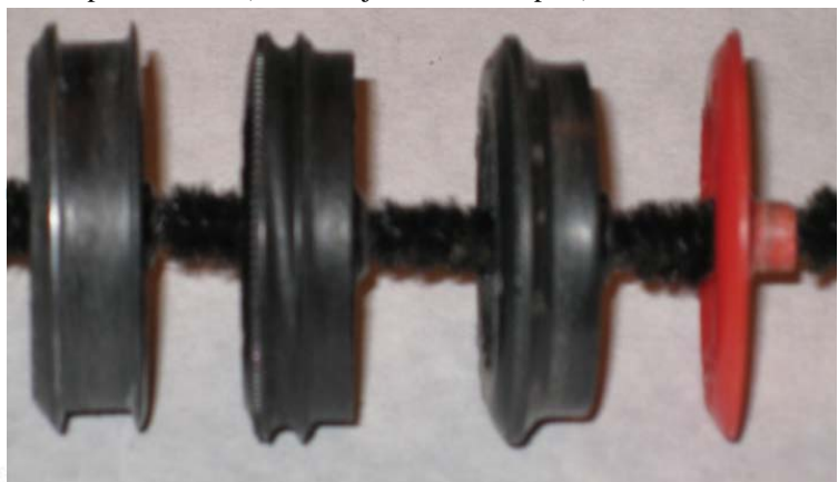
The serrated edge shown in the right picture must remain unmodified. The bumps that appear as dots can't be removed or modified in any way.