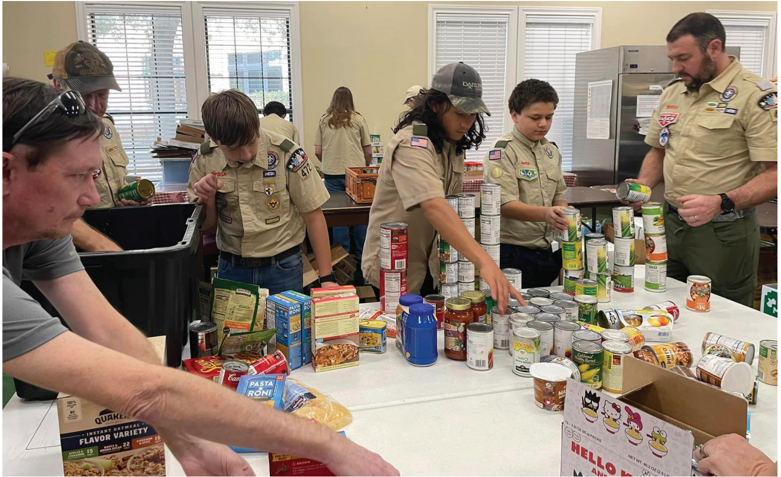
Scouts from Cub Scout Pack 471 and Scouts BSA Troops 98, 472, and 473 donated more than 200 pounds of food to the Elgin Community Cupboard.