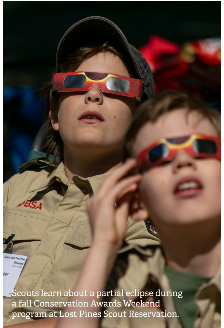
Scouts learn about a partial eclipse during a fall Conservation Awards Weekend program at Lost Pines Scout Reservation.

Whether it's learning to build a fire, witnessing a partial eclipse, or challenging the world in a competition to build the best robot, no program provides as many opportunities to discover new abilities or passions like Scouting.