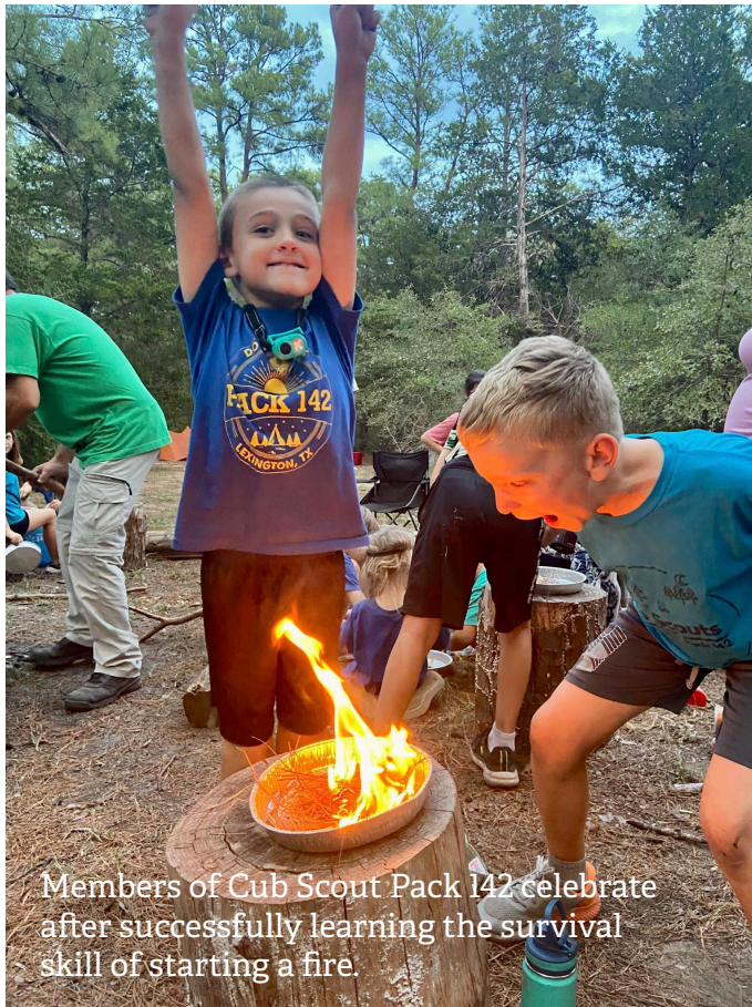
Members of Cub Scout Pack 142 celebrate after successfully learning the survival skill of starting a fire.

Whether it's learning to build a fire, witnessing a partial eclipse, or challenging the world in a competition to build the best robot, no program provides as many opportunities to discover new abilities or passions like Scouting.