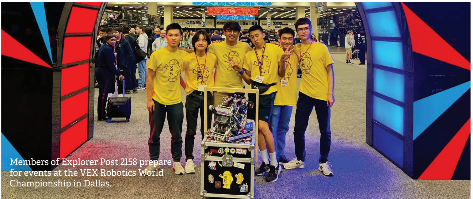
Members of Explorer Post 2158 prepare for events at the VEX Robotics World Championship in Dallas.