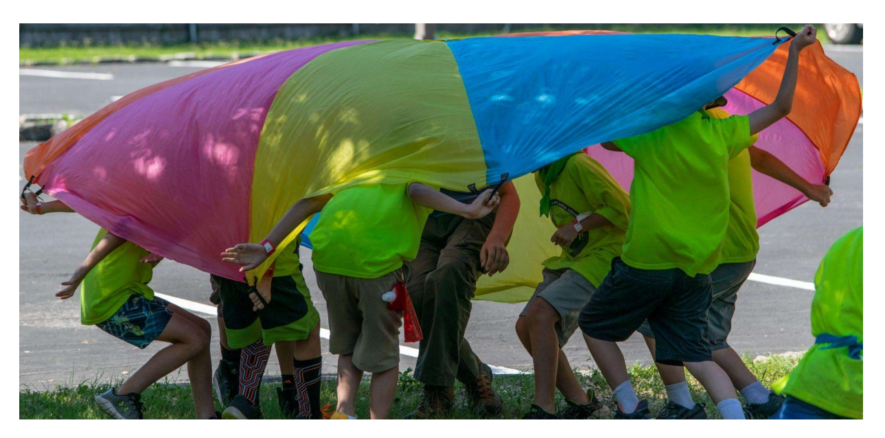
Day Camp is a place for all youth to have fun!

If approved, we will provide the Scout's family with up to half of the cost of camp (subject to availability and budget). All Scouts who receive campership aid should earn or provide part of their fee, in keeping with "A Scout is Thrifty".