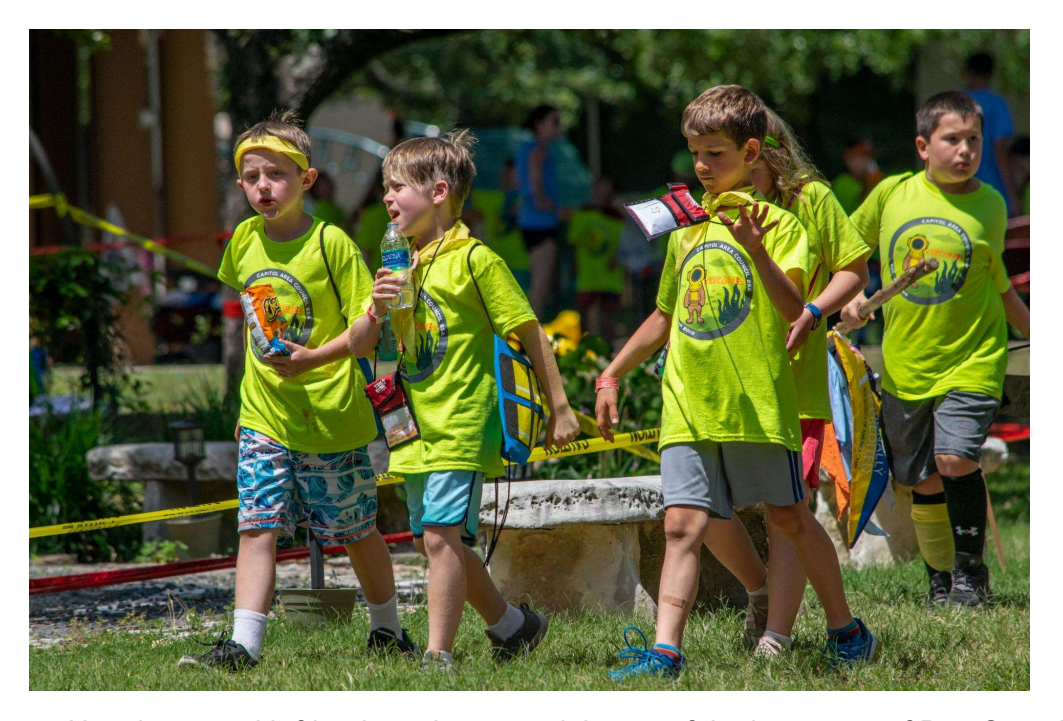
Hanging out with friends and your pack is one of the best parts of Day Camp!

Campers can register individually or as a unit. If you are registering as a pack, please collect all the information for each youth before registering and then select the total number of each type of registrant you have for the whole unit.