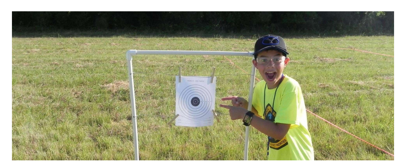
A highlight of Day Camp is making that bullseye shot!